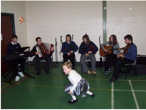
Senior pupils playing some lively tunes at the infant party were greatly appreciated by their audience.